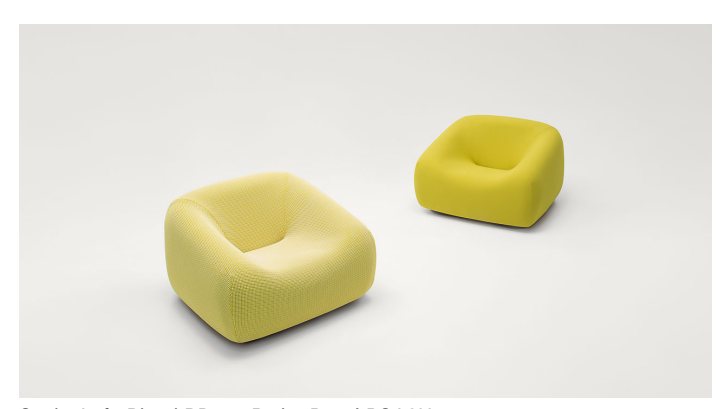
Smile. Left: Blend BD157. Right: Piqué PQA8H