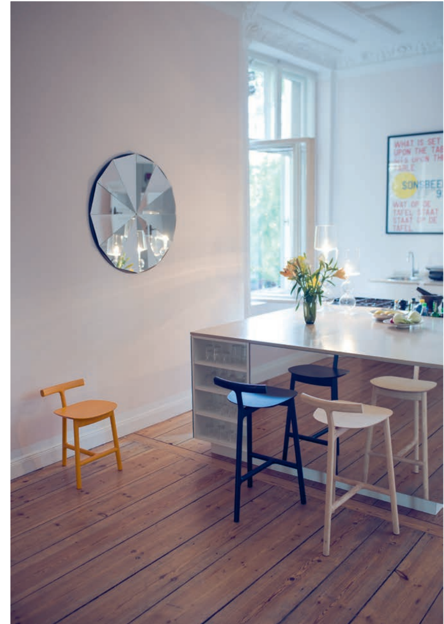
...the art director's home Berlin Schöneberg, Germany