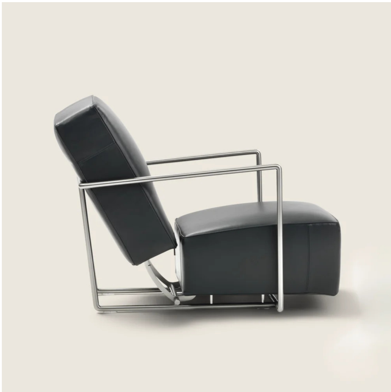
A.B.C. ANTONIO CITTERIO 1996 ARMCHAIRS