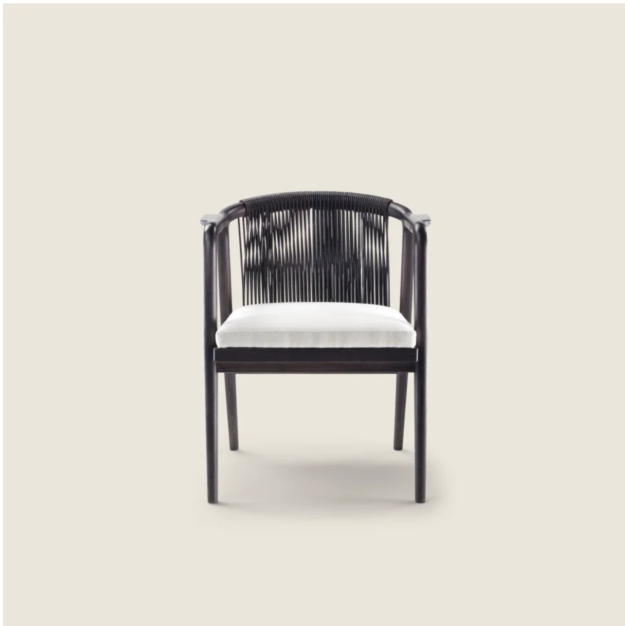
CRONO ANTONIO CITTERIO 2015 DINING CHAIRS/CHAIRS