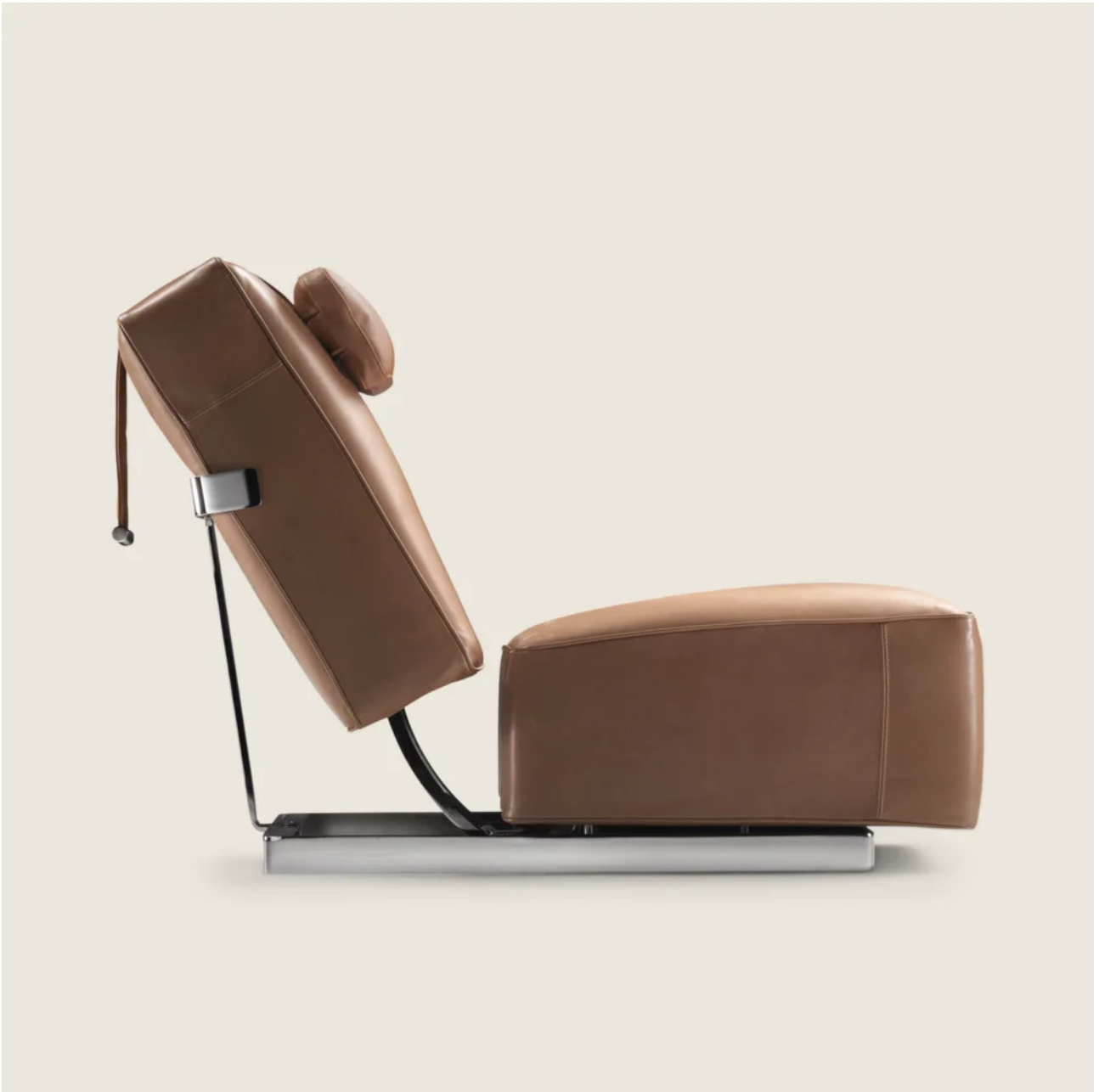
A.B.C.D. ANTONIO CITTERIO 2014 ARMCHAIRS