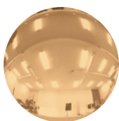
Metal 4 finishes Available