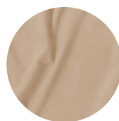
Eco Nabuk 53 Colours Available