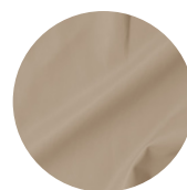
Top Grain Leather 83 Colours Available