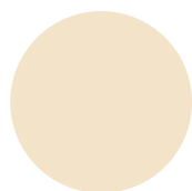
Lacquers 14 Colours Available