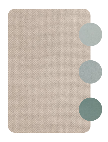
SD SEPIA 1