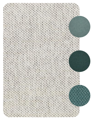
TC NEBBIA 2