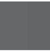
Alluminio cromato Bright stainless steel