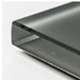
extra clear frosted glass graphite painted