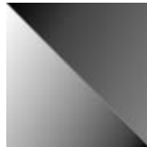
extra clear graphite