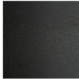
GFM69 graphite embossed