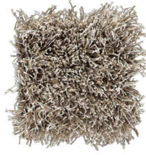
Soft Grey 850