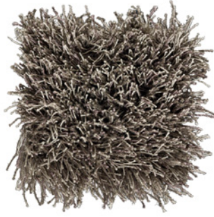
Steel Grey 550