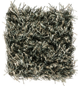
Dark Grey 1