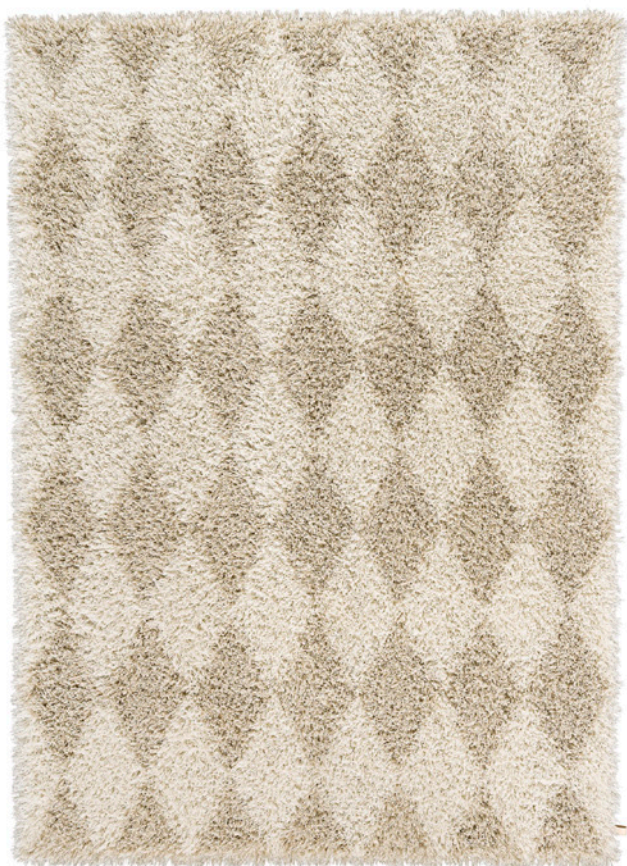
Rug: Harlequin Cream Fogg Harlequin is available in the following sizes: 170x240 & 200x300 cm