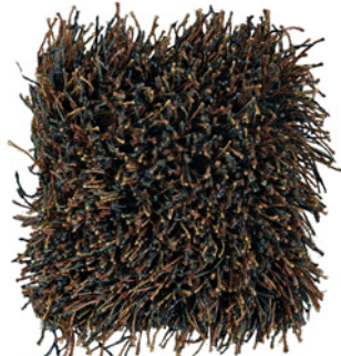
Chocolate Brown 770