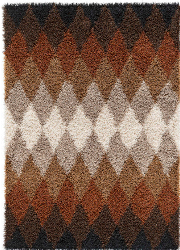
Rug: Harlequin Cognac Fogg Harlequin is available in the following sizes: 170x240 & 200x300 cm