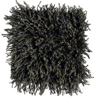
Thunder Black 530