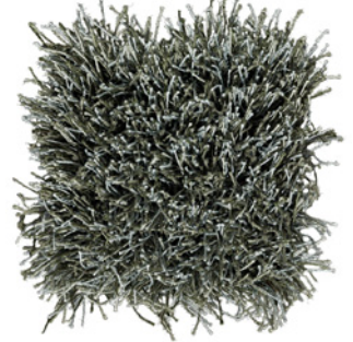
Zink Grey 520