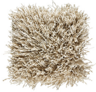
Light Beige 880