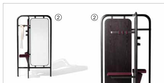
2 Amiral 53715 leather 9118 fin.93