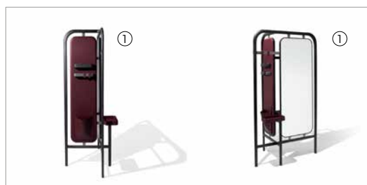
1 Amiral 53715 leather 9118 fin.93