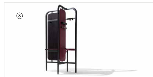
3 Amiral 53715 leather 9118 fin.93