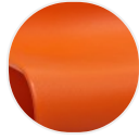
matt orange polyethylene