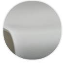
matt white polyethylene