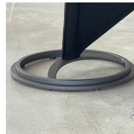
Dark brown metal