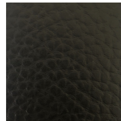
Black embossed hide leather