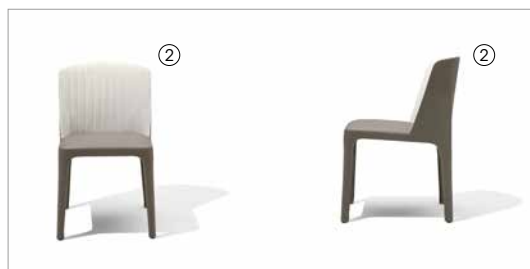
2 Bicolette 60190 bisbino 5064/leather 9110