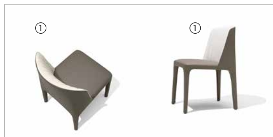
1 Bicolette 60190 bisbino 5064/leather 9110

Sedia rivestimento esterno e seduta in pelle, interno schienale tessuto o pelle Chair leather exterior and seat, fabric or leather interior cm 50 x 57 x h 83 in 19 5/8 x 22 1/2 x h 32 3/4