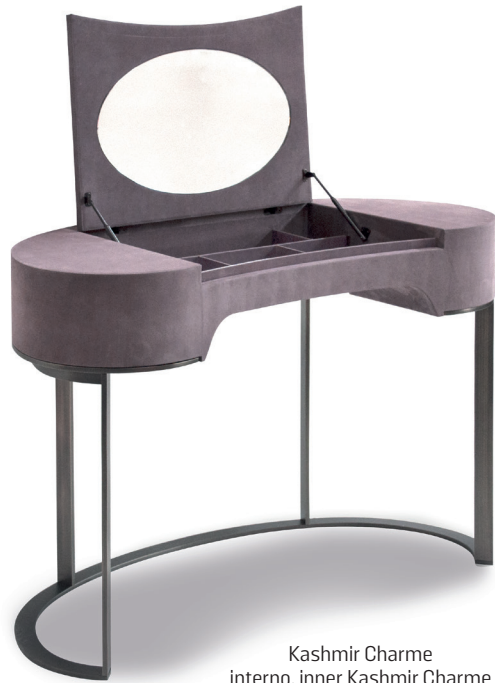
Kashmir Charme interno, inner Kashmir Charme b. brunita, burnished