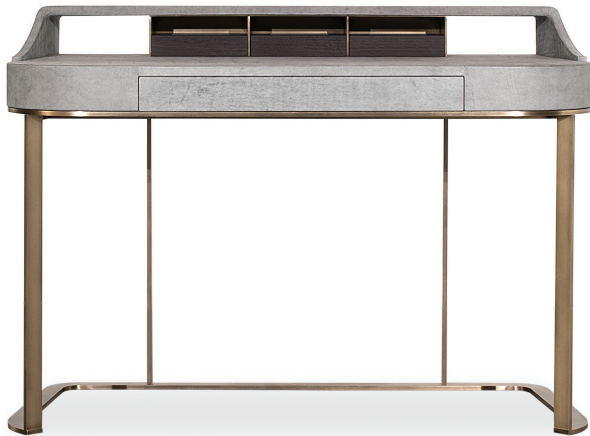
Bo.Hemian Siberia b. ottonata, brassed