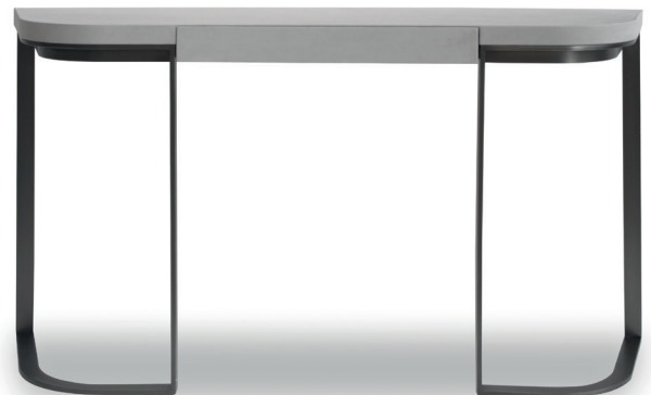
Kashmir Nuage b. brunita, burnished

Base in metallo ottonato satinato, in metallo brunito spazzolato a mano o in metallo nichelato satinato, con vernice opaca. Struttura in MDF con rivestimento in pelle.