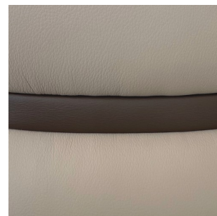
Beige leather with dark brown band