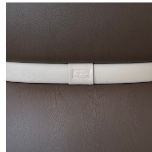
Dark brown leather with beige band