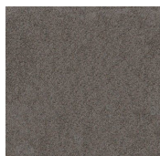
Sand 012 Sand 012