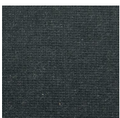
Blue grey Blue grey