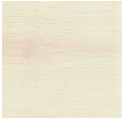
Frassino naturale Natural ash