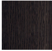
Frassino tinto tabaco Tobacco stained ash