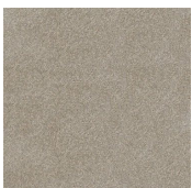
Sand 06 Sand 06