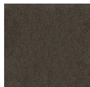
Grey 020 Grey 020