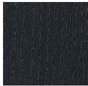
Nero poro aperto Black open pore