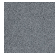
Grey 074 Grey 074