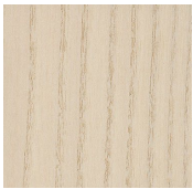
Bianco poro aperto White open pore