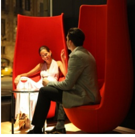
HOTEL OHLA - BARCELONA