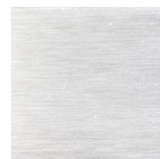
Satined brushed stainless steel