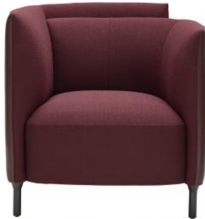
ARMCHAIR COMPLETE ITEM