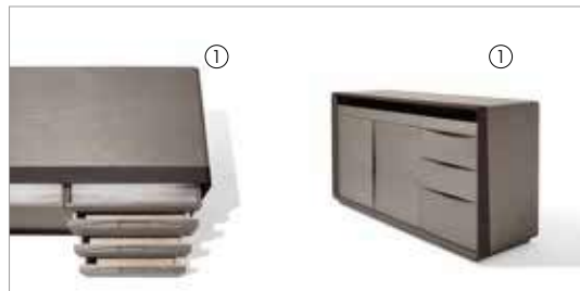
1 Frame 59401 saddle leather tobacco fin.2B