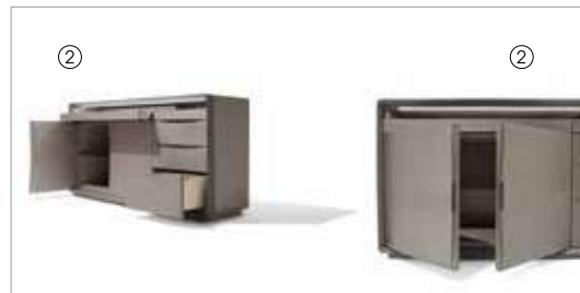
2 Frame 59400 saddle leather dove-grey fin.2B