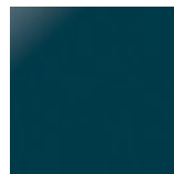
L9E Deep Blu