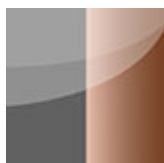
grey - bronze