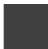
524 Verniciato Canna di fucile